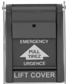
904 3-1/2" x 4-3/4" (88.9 x 120.6mm)