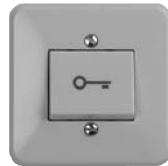
909S/909F 2-3/8" x 2-3/8" (60.3 x 60.3mm)