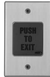
917 4-1/2" x 2-3/4" (114.3 x 69.9mm)