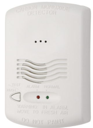
CO1224T Carbon Monoxide Detector