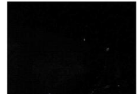
Without IR light