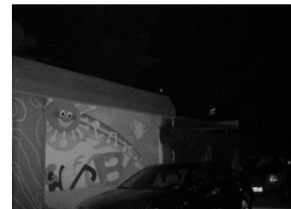
With IR light