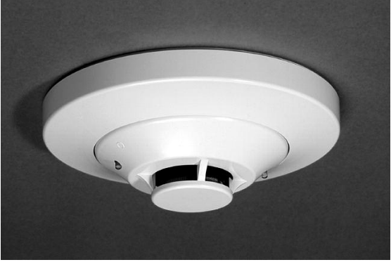
IDP-Photo (Base not Included)