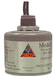
Weatherproof Enclosure N-4 DIMENSIONS: 2-1/4" High 2-1/4" Diameter