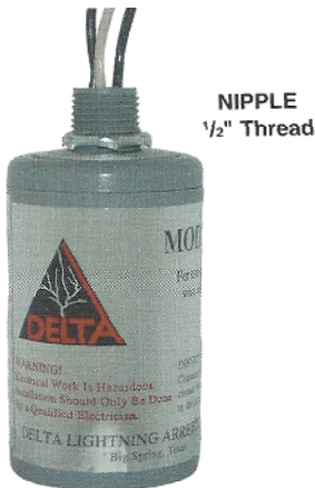
Weatherproof Enclosure N-4 CASE DIMENSIONS: 4 1/2" High 2 1/4" Diameter

LA602DC for 0 to 1100 Volts, dc LA302DC for 0 to 500 Volts, dc LA302R for 0 to 300 Volts, ac