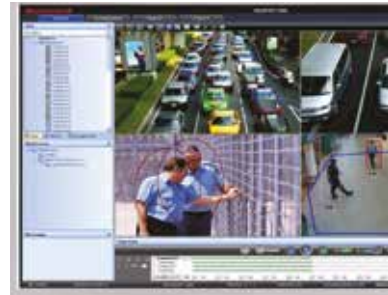
MAXPRO VMS Client Viewer 2x2

and People Counter video analytics, as well as other Honeywell products and solutions. The feature-rich user interface truly offers a unified management platform across many disparate systems to further embody Honeywell's concept of "Learn One, Know Them All."