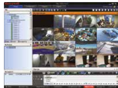
MAXPRO VMS Client Viewer 4x4