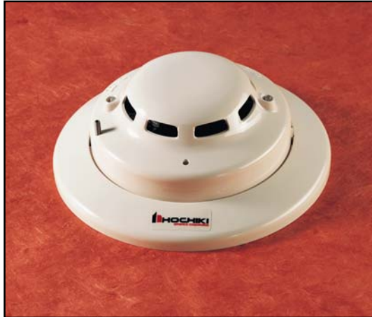
Shown with Trim Ring